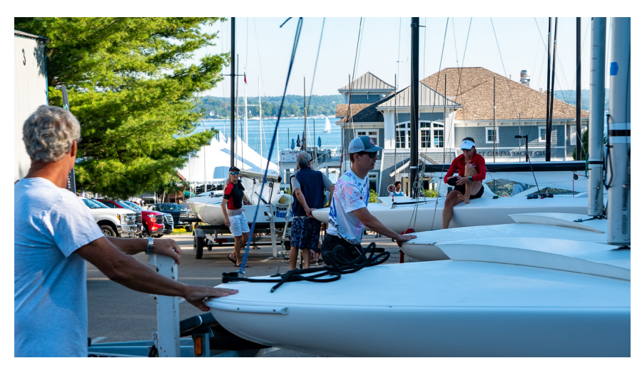
Lake Geneva Yacht Club hosted the 2022 Inland Lake Yachting Association Annual Championship last August for just under 200 boats in classes A, C, E, and MC. The 2023 Inland is scheduled for LGYC, August 16 - 20, the 20th time Lake Geneva has held the event.