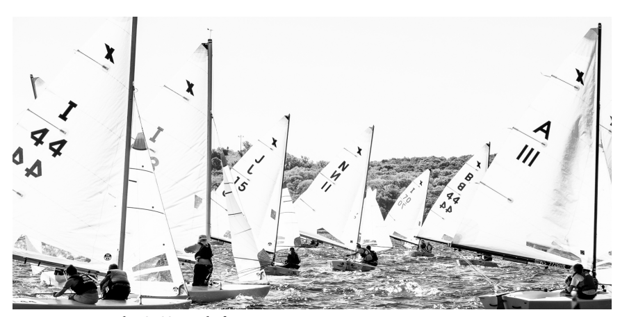
X-Boats racing in the GLSS Dinghyfest.