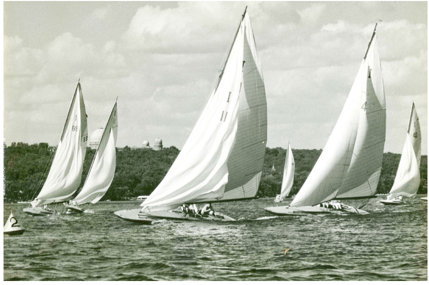
A-Scows preparing to round the mark - 1940's